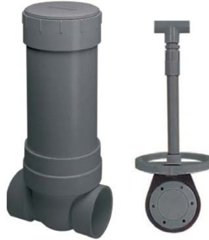
Valve with Extension Kit